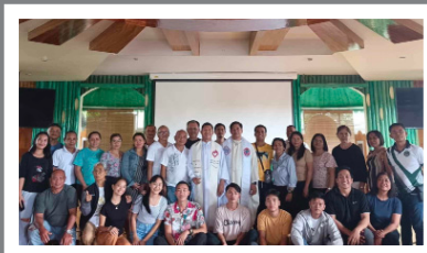
Just some of the team at the MSC Centre for the Poor