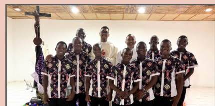
New students join the mission