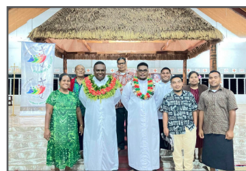
Perpetual Profession of two MSC brothers in Veivatuloa