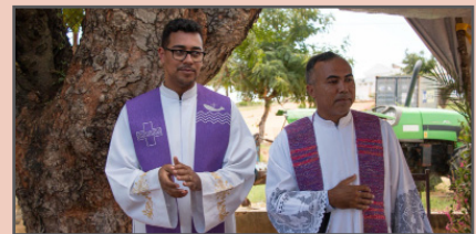
Taking on new parish duties