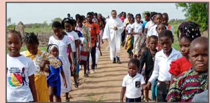
Opening the Jubilee Year of Hope

All photos via the Facebook page for MSC Mozambique @peduardopaixaomsc