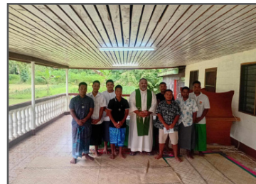
New MSC pre-novitiates in the Province of the Pacific Islands