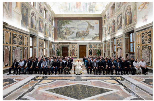
MSC Community from around the World meets Pope Francis

In closing, Pope Francis highlighted the indispensable role of prayer in cultivating the qualities of closeness, compassion, and tenderness. He emphasized that prayer is essential for keeping their mission and spiritual vitality. “Thank you, dear brothers, for what you are and what you do! Continue your work with enthusiasm. Flee from sadness, which is the cankerworm that ruins personal and consecrated life! That sadness that brings you down, not the good sadness of repentance, that is another thing, but that daily sadness is a woodworm that ruins. I bless you from my heart. And I ask that you pray for me”.