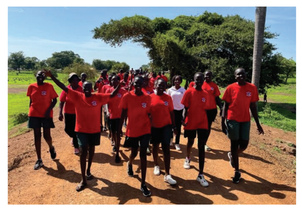
Senior Four studets

The girls were delighted to get out and about in the community. The people in turn were happy to meet our students, especially when they found out what they were doing. Not so long ago such a trip would have been impossible, due to the proliferation of small arms, banditry on the roads, and widespread insecurity.