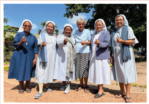
Daughters of Our Lady of the Sacred Heart welcome new sisters

We also had two new arrivals to the Diocese. The sister congregation of the MSCs, the Daughters of Our Lady of the Sacred Heart, welcomed two new members from Indonesia to their Mapourdit community. One is a trained teacher and the other an excellent nurse. We wish them the very best.