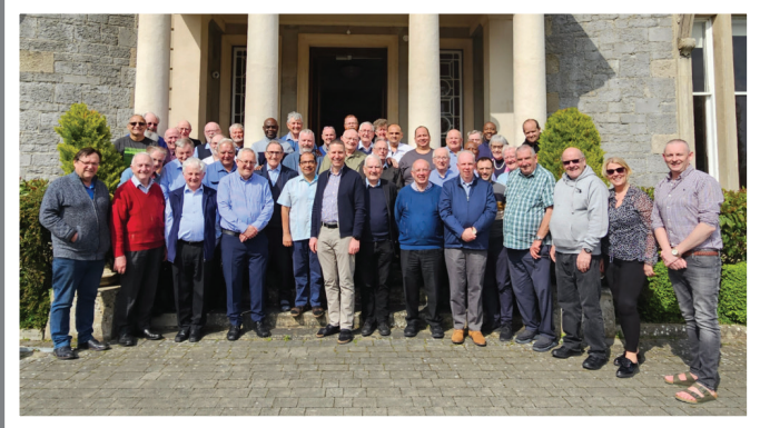
Participants of the MSC Irish Province Provincial Chapter 2023