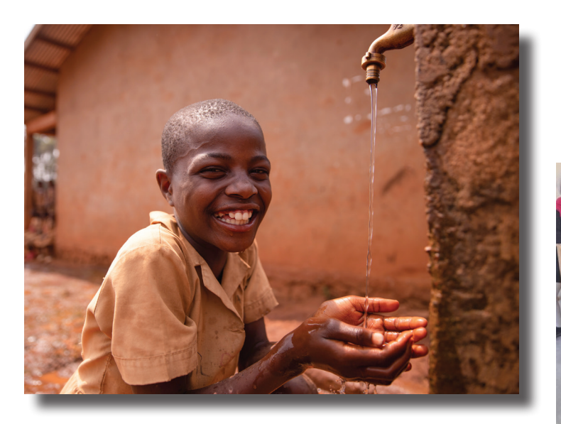
PLEASE DONATE NOW

For decades, the MSCs have worked tirelessly in the Holy Rosary Church in Ivory Park (in Johannesburg, South Africa). There is a central large kitchen within the compound, where we care for many children, some of these children's parents have died due to HIV/Aid. Here they receive spiritual, emotional and physical nourishment. Recently, with your help, a well was bored to provide clean water for the community. This is just one of the water projects we support with your help in Africa.