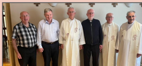
Golden Jubilee celebrations with the MSC community