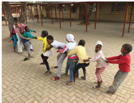
A tug of war at the Holy Family Care Centre!