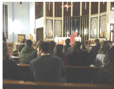
Prayer and song at the Nightfever event in Birmingham

We're now almost halfway through 2018, and it has already been an incredibly rich and rewarding year for the MSC Vocations Team!