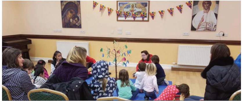
MSC Youth Team Children's Mass with Parents and Toddlers Group

Hello everybody, it's the MSC Youth Team here!