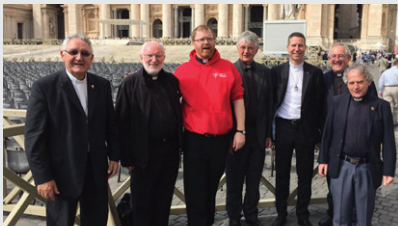
The Irish MSCs in attendance at the recent MSC General Chapter.