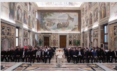
A group picture of all MSCs accompanied by Pope Francis.

During a private audience between his Holiness and the members of the 2017 General Chapter of the Missionaries of the Sacred Heart on Saturday 16th September, 2017, Pope Francis said “Return to your first and only love.”. In an uplifting, yet profoundly challenging address the Pope stated that the MSCs before him were called to keep their “gaze fixed on Jesus Christ and learn from Him how to truly love with a human heart, to care for the lost and hurting members of his flock, to work for justice and show solidarity with the weak and poor.”